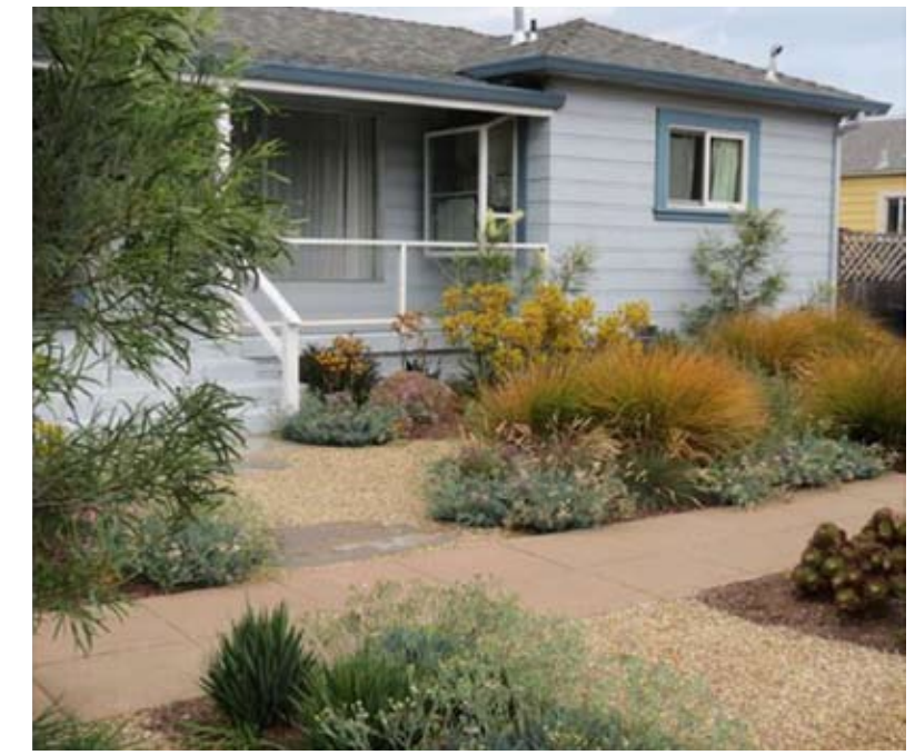
Suzanne Arca, APLD; Front yard in Richmond

The California garden is changing. In a neighborhood not so far away, the revolution has started. Dull, conventional lawns are being transformed into vibrant oases for birds and bees—filled with color, texture, and scent. These gardens have spaces for gathering with meandering paths and edible plants. Low-water plants frame the home and use very little of our most precious resource—water.